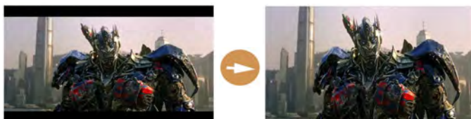
• Signal Clip