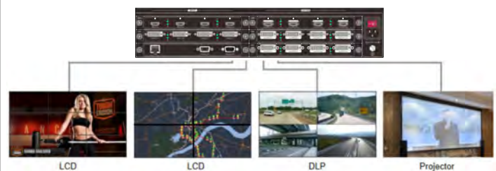
• Multi-group Control