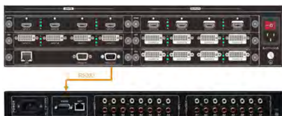
• Third-party Control